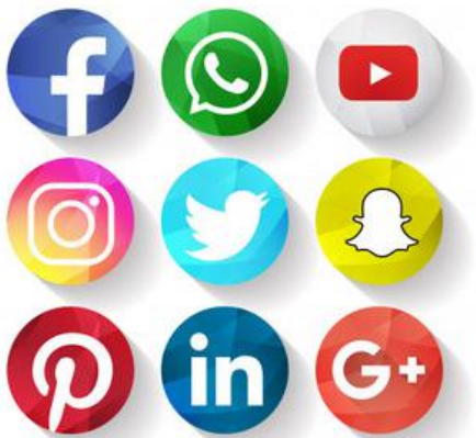
SOCIAL MEDIA CONSULTING