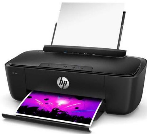
BRANDING & PRINTING SERVICES

Ekson Afrique has a team of social media, digital marketing, print and creative design experts. We have helped several companies and organizations reach their online marketing objectives.